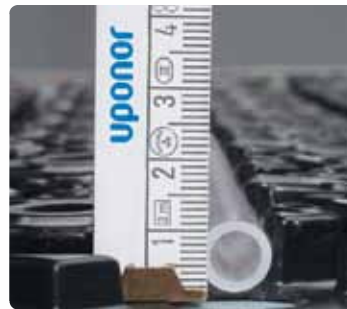
Minitec panel height