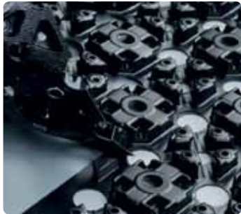
Easy installation of Minitec panel

The adhesive surface ensures secure fixture to the floor.