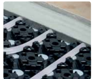
Short heat-up times thanks to thin self levelling compound layer

The levelling compound bonds firmly with the panel thanks to punched holes in the structure.