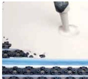
Levelling compound can spread easily

Tight pipe fixation allows easy lap installation to cover the entire underfloor heating surface.